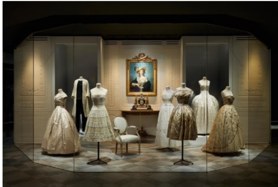
Christian Dior, Couturier du Rêve

Artists with a strong artistic identity can always inspire fashion designers. A typical example is the historical Fall Mondrian Collection of 1954 by Yves Saint Laurent, inspired by the work of Dutch artist Piet Mondrian, which I believe deeply and decisively influenced the relationship between fashion and art.