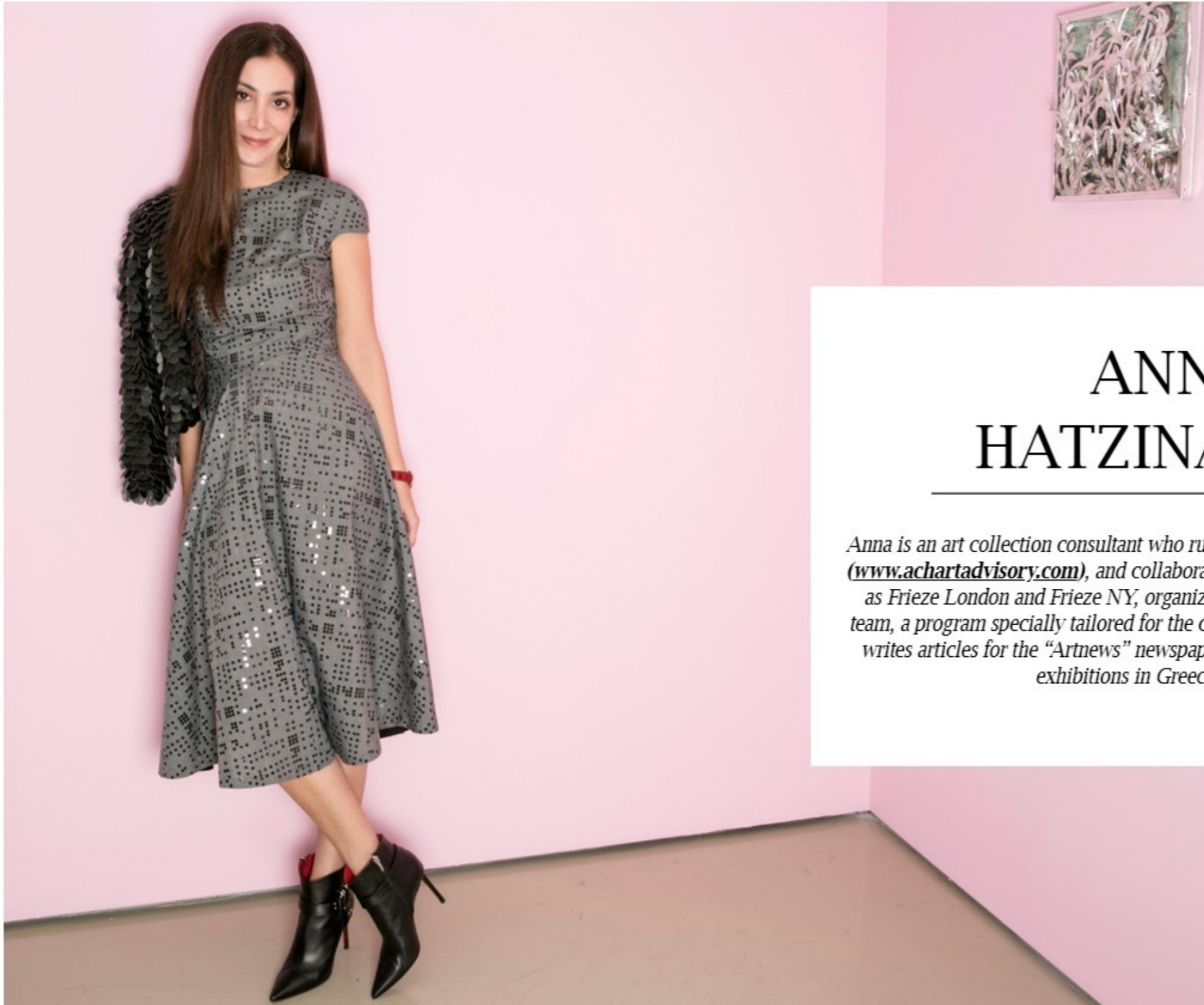
Dress and jacket, Deux Hommes , Ankle boots Cesare Pacciotti (personal collection)